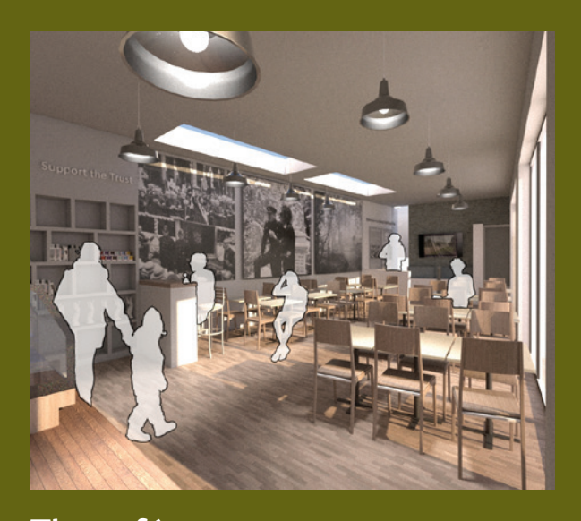
The café © Kaner Olette Architects